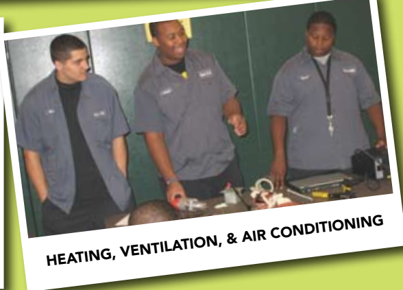
HEATING, VENTILATION, & AIR CONDITIONING