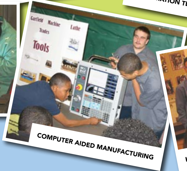
COMPUTER AIDED MANUFACTURING