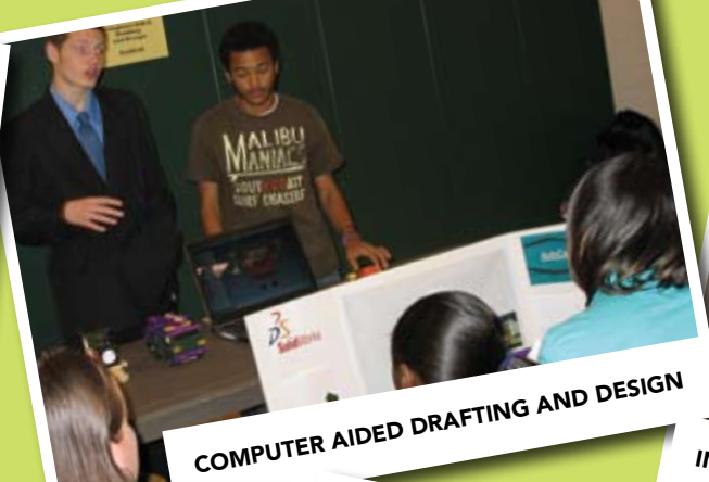
COMPUTER AIDED DRAFTING AND DESIGN