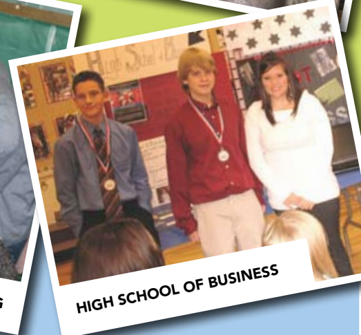
HIGH SCHOOL OF BUSINESS