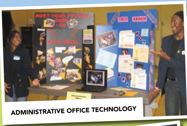
ADMINISTRATIVE OFFICE TECHNOLOGY