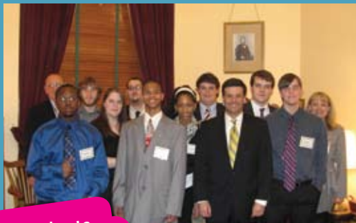
Senator Kevin Coughlin